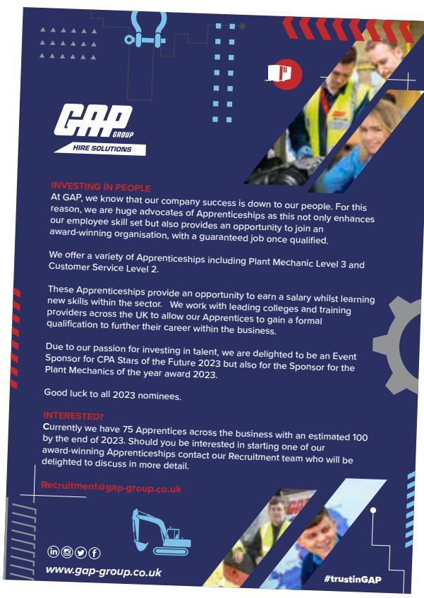
GAP sponsored the Plant Mechanic of the Year award at Stars of the Future 2023