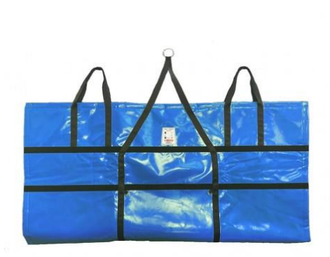
Solar panel bag