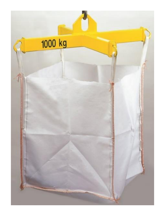
Figure 3: Example of a spreader frame

© CPA TIN TCIG-026 5 of 5 Issue Date: 30.01.2023 Issue B