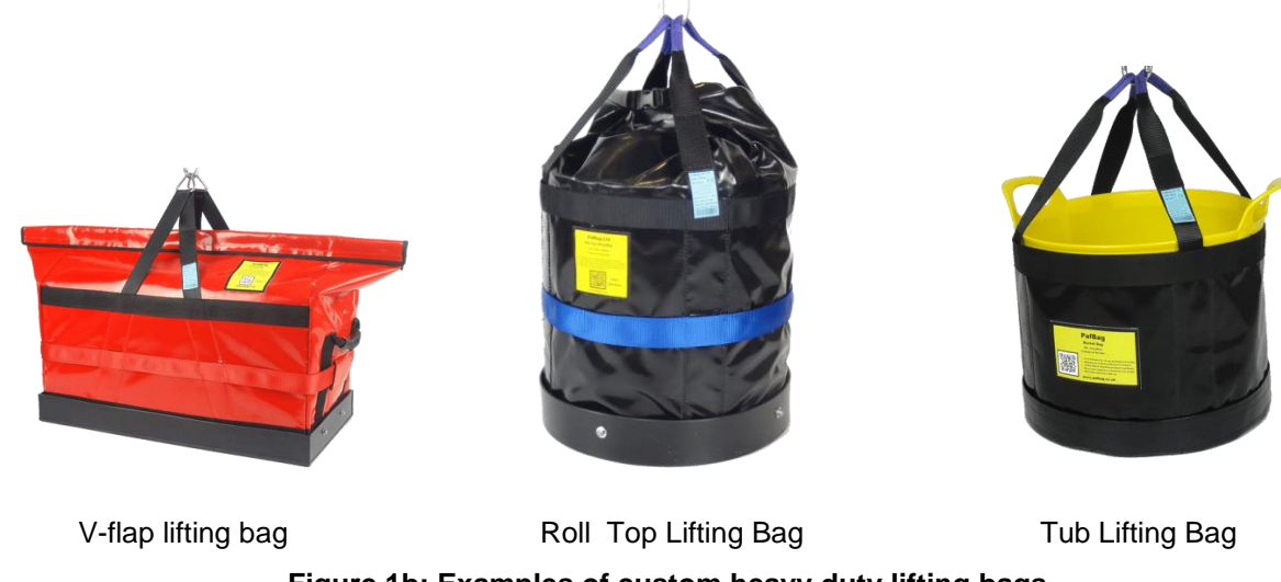
Figure 1b: Examples of custom heavy duty lifting bags