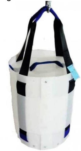
Scaffold component bag