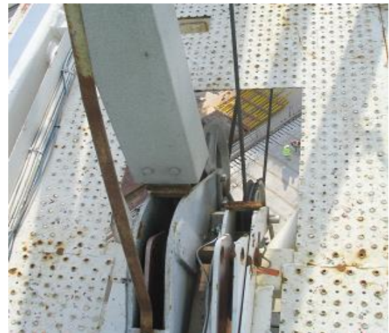
Figure 2 – Openings in Deck Panels