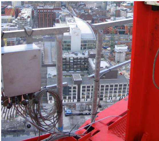
Figure 1 – Handrail Gaps