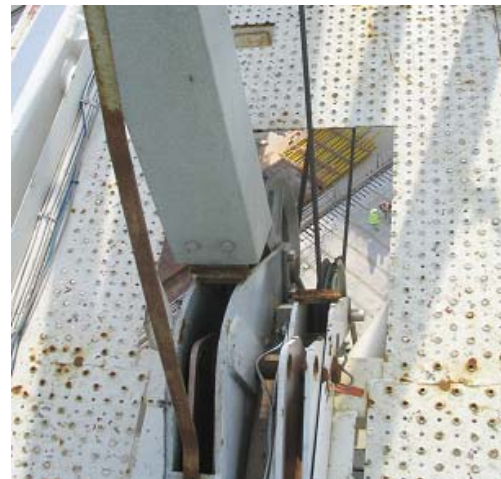
Figure 2 – Openings in Deck Panels