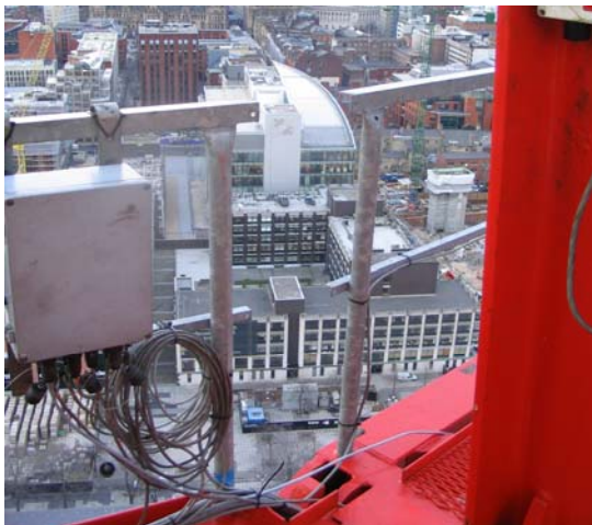
Figure 1 – Handrail Gaps