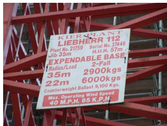
Figure 2 - Acceptable