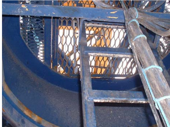
Figure 2 – Cables Attached to Ladder