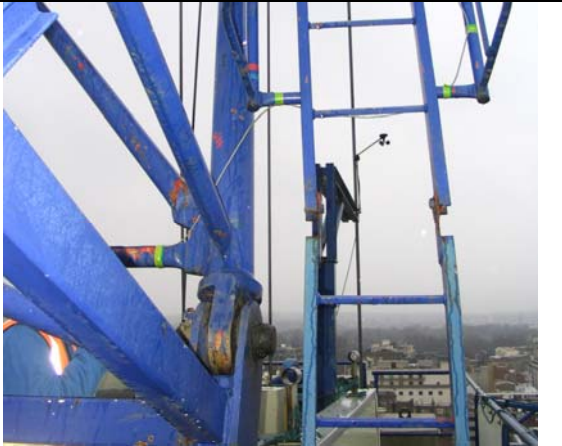
Figure 1 - Uneven Rung Pitch