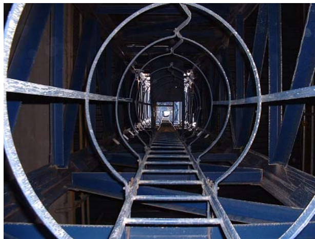
Figure 3 – Single Vertical Ladder